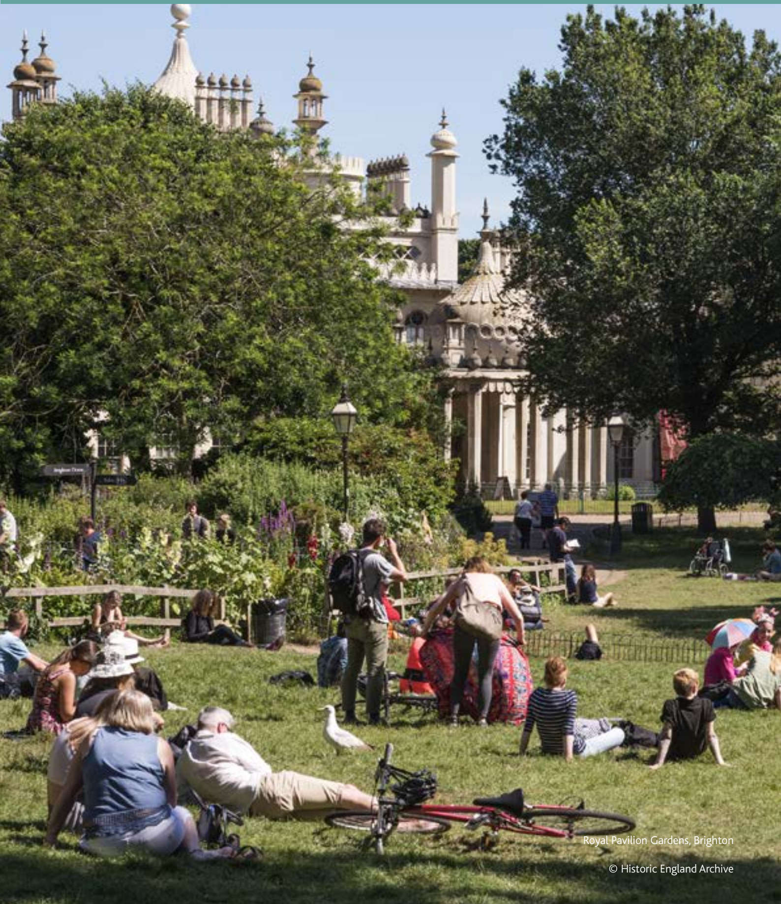
Royal Pavilion Gardens, Brighton