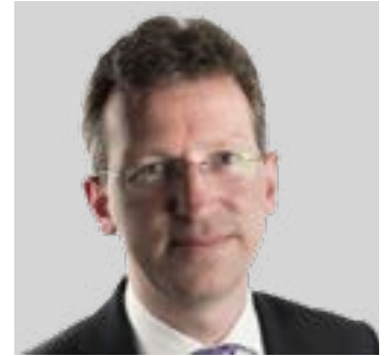
Rt Hon Jeremy Wright QC MP

I am proud to present the work which my Department, and our colleagues in the arms-length bodies we support, such as the Arts Council and Sport England, are doing to help places flourish. I hope Local Enterprise Partnerships and other policy-makers will make good use of this manual and help our sectors to make their full contribution to local prosperity.