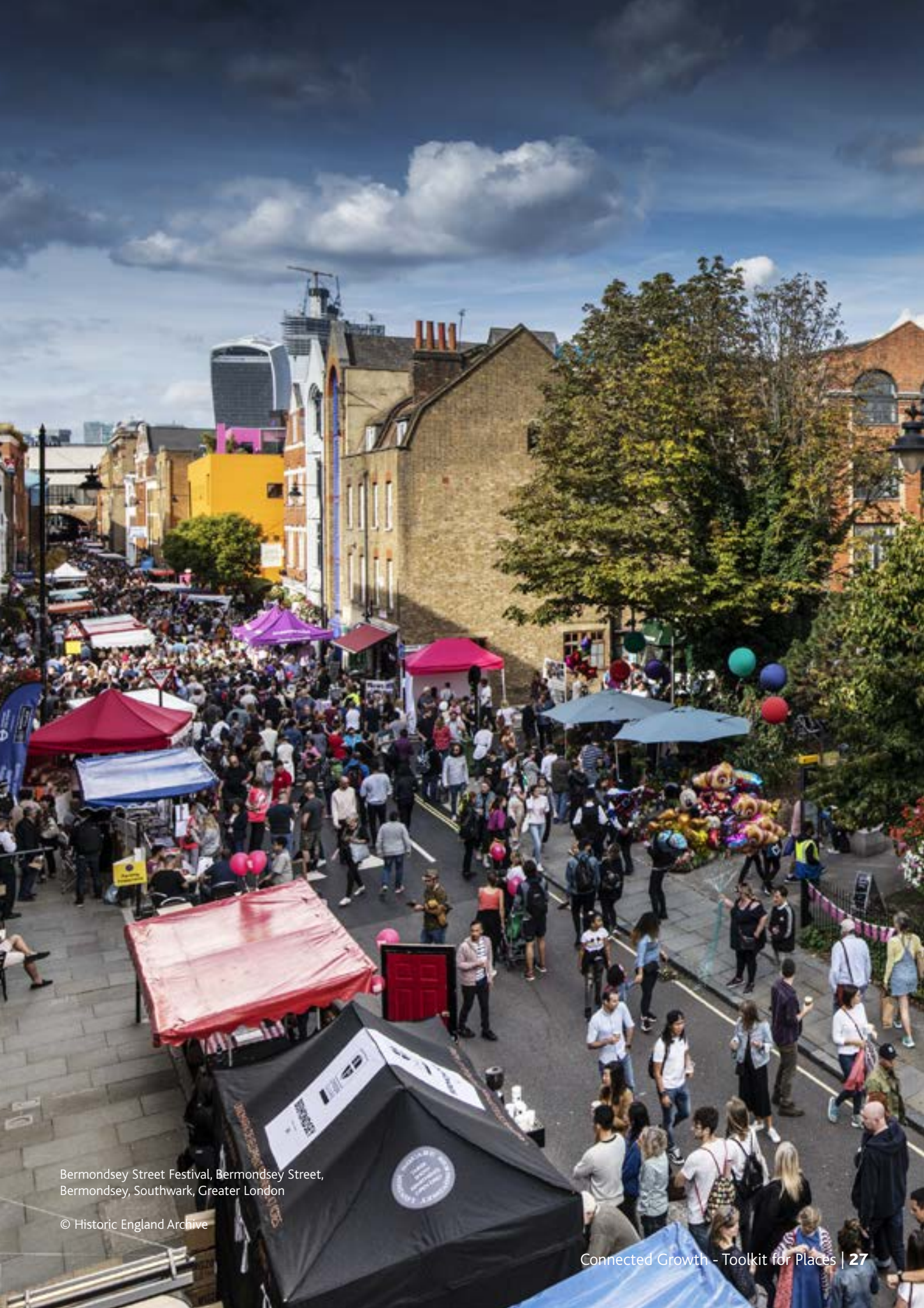
Bermondsey Street Festival, Bermondsey Street, Bermondsey, Southwark, Greater London